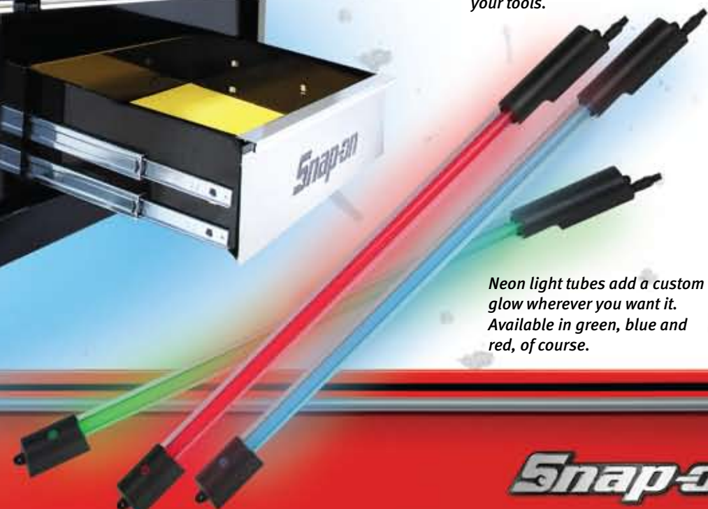
Neon light tubes add a custom glow wherever you want it. Available in green, blue and red, of course.