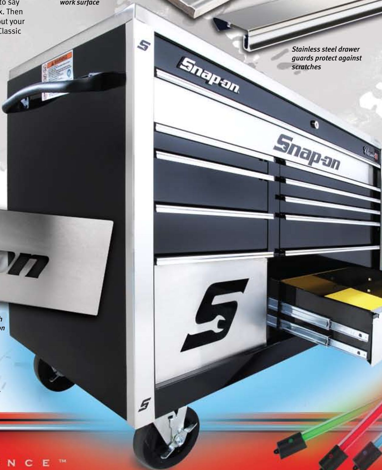
Stainless steel drawer guards protect against scratches