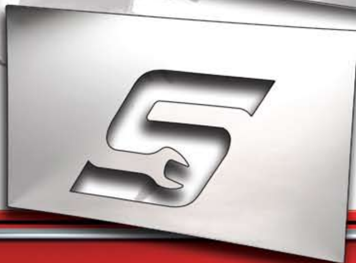
Stainless steel drawer front with laser-cut "S" logo. Even cooler.