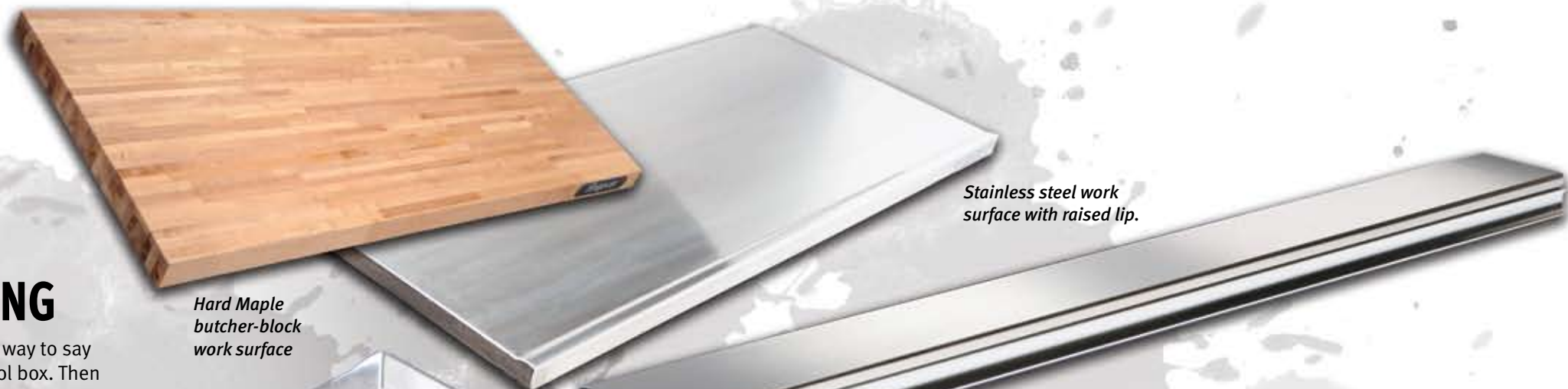
Hard Maple butcher-block work surface

Genuine northern hard maple butcher-block or high grade 16 gauge 304 stainless steel lets your Classic roll cab double as a workbench. New black bed liner top also available (not shown).