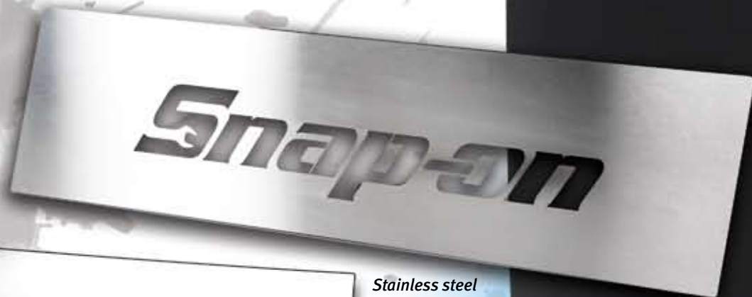
Stainless steel drawer front with laser-cut Snap-on logo. Cool.